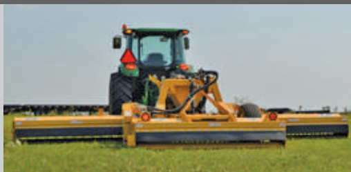
Triple Flail mowers available up to 22' wide.

Call us today to schedule a consultation: 1.855.449.5858