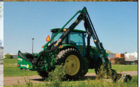
Rear mount mowers available up to 30' reach.