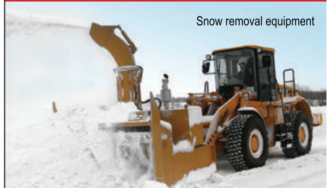
Snow removal equipment

Build to withstand arduous work 24 / 7 parts & service