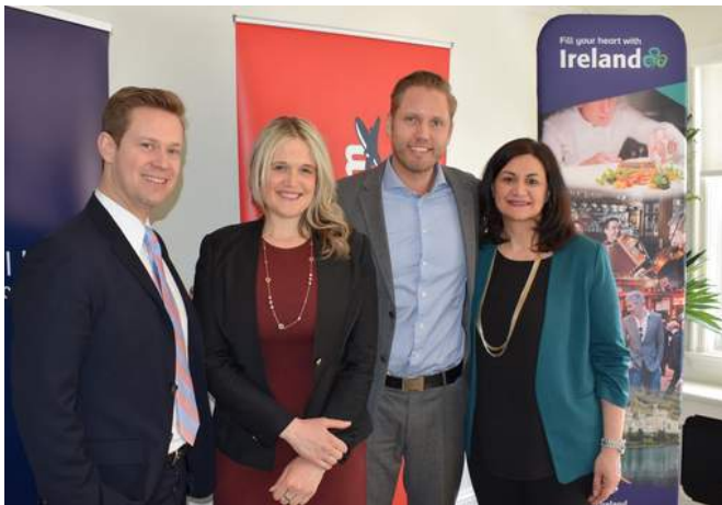
Norwegian Air launched their new service to Dublin in Hamilton, ON Wednesday. The new service starts March 31.