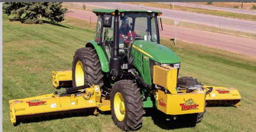
Tiger Tractor Mounted Triple Flail Mowers

Call us today to schedule a consultation: 1.855.449.5858