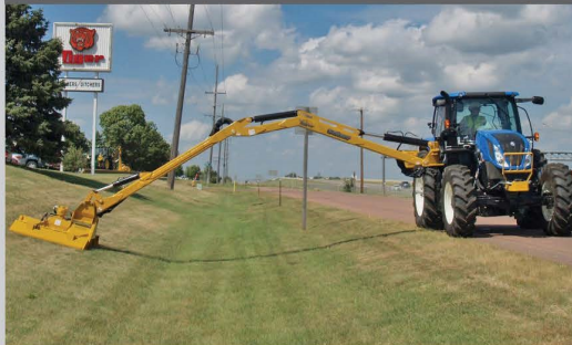
Tiger Mid Mounted Boom Mowers up to 30'