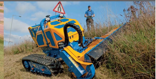
Bomford Flailbot Remote Controlled Steep Slope Mowers