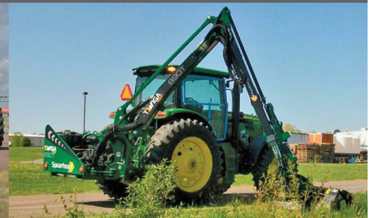
Spearhead Rear Mount Mowers Available up to 30' Reach